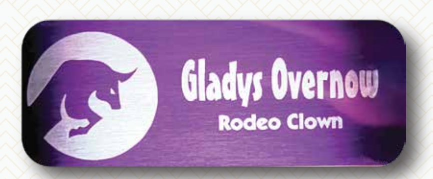
104AL - Laser Engraved Aluminum Badge Purple/Silver

These eye-catching badges put your logo on a bright background and the silver engraving is SURE TO ATTRACT ATTENTION FROM EVERYONE.